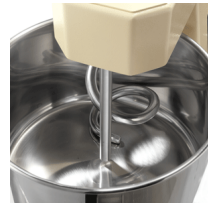
S/S bowl and shaft